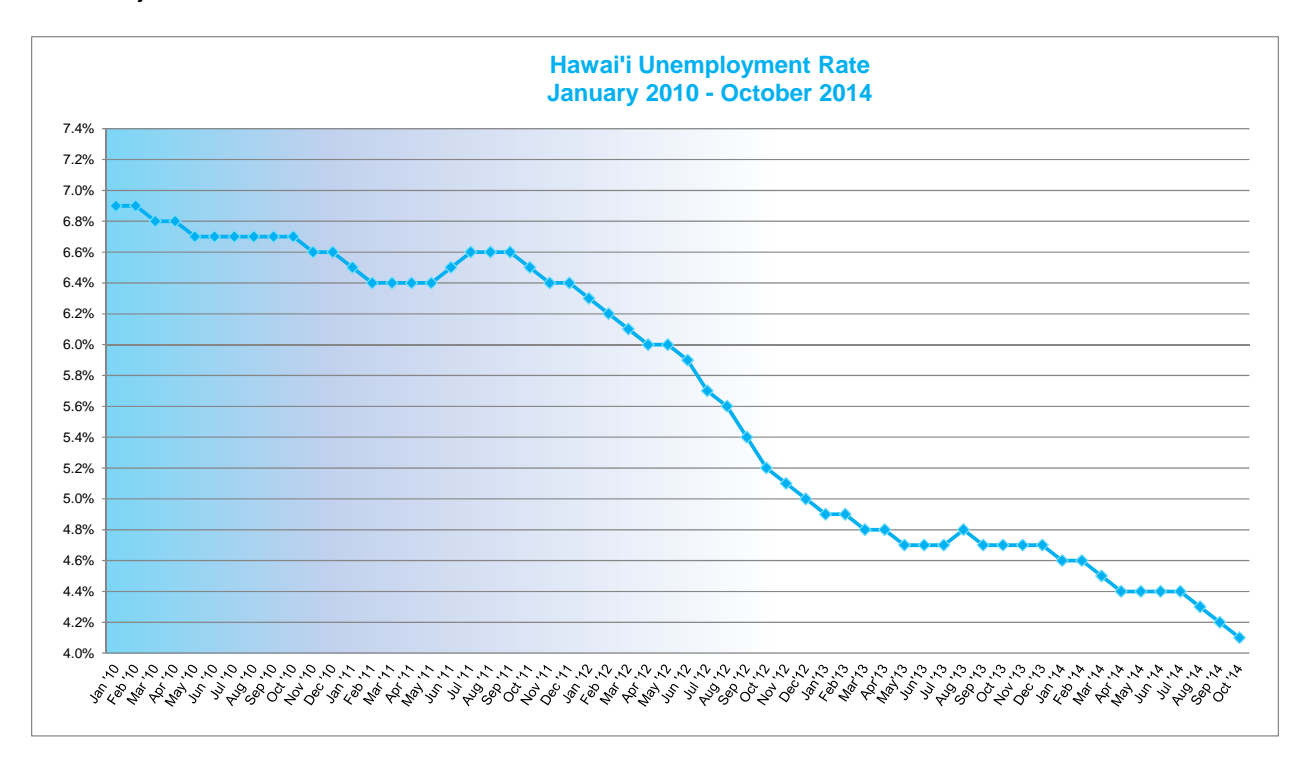
Equal Opportunity Employer/Program

"Unemployment benefits play a major role in stabilizing the economy during recessions by maintaining the purchasing power of those without income from employment, and DLIR's duty is to protect employers against the double 'whammy' of diminishing profits and rising unemployment taxes during recessionary times," said DLIR Director Dwight Takamine. "Unemployment benefits also provide the ability for a worker unemployed through no fault of their own to put food on the table and shelter over the heads of their family while they search for another job."