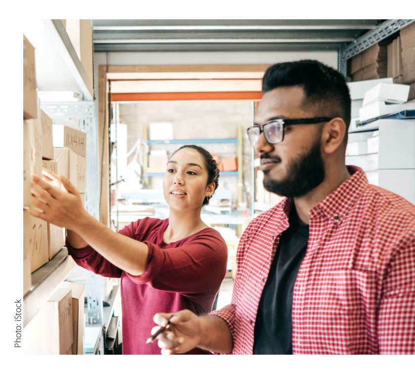
2 | HIOSH SMALL BUSINESS SAFETY AND HEALTH HANDBOOK

OSHA's Safe + Sound campaign encourages every workplace to have a safety and health program. Through this campaign, OSHA works with NIOSH and other organizations to provide resources to help employers develop safety and health programs and to recognize the successes of these programs.